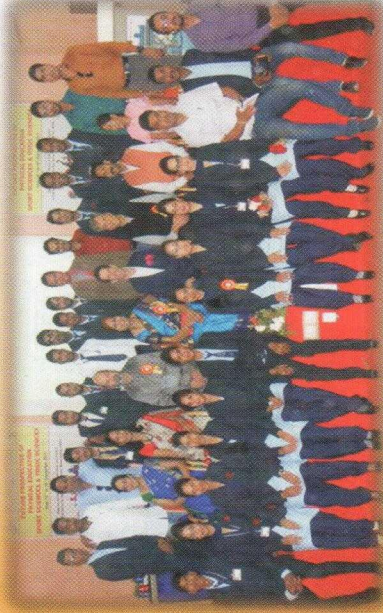
International Conference 2017

Self Employability Skills Development in Physical Education and Sports Sciences 13 th & 14 th December 2018